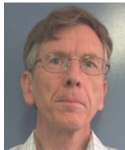
President Stan Pump 2003-08